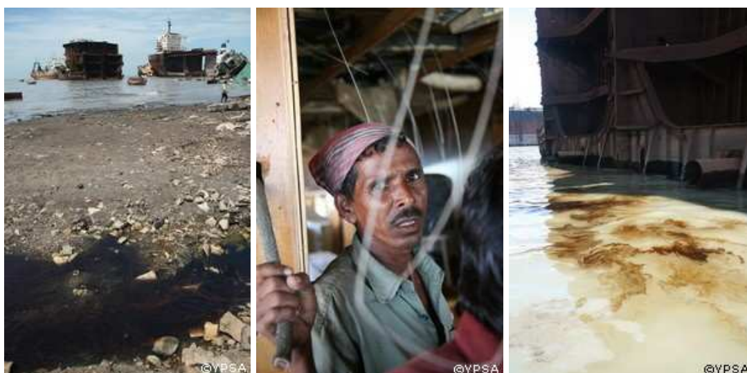
Oil pollution, Chittagong shipbreaking yard, Bangladesh 2007

Guidance on how to test the veracity of reuse/refurbishment claims needs to be developed and seen in light of clarifying the meaning of «intent to dispose». Cases such as the Ricky in Denmark, SS Norway in Germany, and more recently the Aqaba Express in Spain and Valmont Express in Greece, clearly demonstrate this need. Training of port authorities to better identify and control suspected end-of-life vessels should be prioritised.