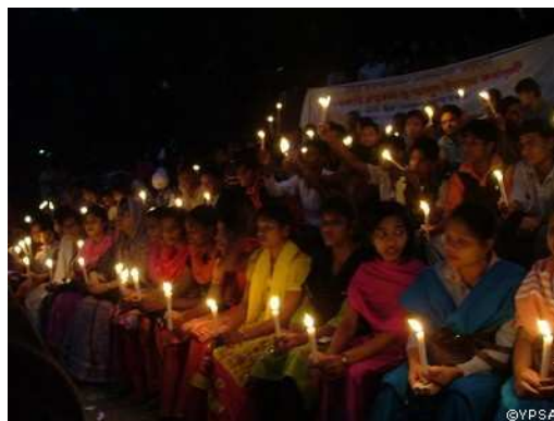
Demonstrations for improved working conditions at the shipbreaking yards in Chittagong, Bangladesh 2006