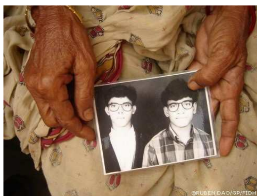
Mother holding picture of dead sons, Bangladesh 2005

A key aspect to combating illegal dumping of toxic waste is therefore to ensure greater transparency in the flagging and ownership information of vessels . Ideally, it should be registered in publicly available, up-to-date and reliable databases where the basic information would appear: current and previous vessel names and flags, owners and beneficial owners, country of ownership, call-sign, tonnage, etc. Details of ownership and management of ships should be made fully transparent to enable appropriate follow-up to breaches of regulations, and effective liability arrangements must be put in place to ensure that the guilty parties are held responsible for the consequences of poor shipping standards and practices.