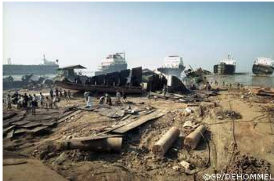
Chittagong shipbreaking yard, Bangladesh 2004

As there are currently few yards that comply with existing safety and environmental standards the EU should develop such capacity within its Member States as well as upgrade the working conditions on the yards in South Asia so that pre-cleaned vessels can be safely dismantled there. The costs of running an EU certification and auditing system could be linked to a ship dismantling fund (see question 9).