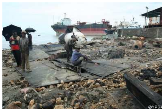
Chittagong shipbreaking yard, Bangladesh 2007