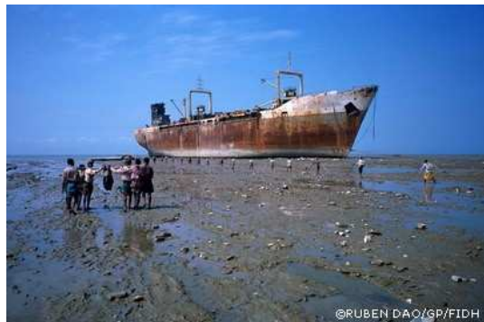
Chittagong shipbreaking yard, Bangladesh 2005

A stricter EU policy could however lead to a massive «exodus» of European ships to cheap flags of convenience (FOC) countries, not respectful of environmental or workers' rights standards. Older vessels are already often sold to owners using open registers with minimum capacity to ensure appropriate implementation of international rules and standards and cease to operate in European waters to avoid the stricter port state controls of the EU. It is no new dilemma for EU governments that if they police international rules strictly, and enforce additional constraints, they may find that owners transfer their vessels to less onerous registers.