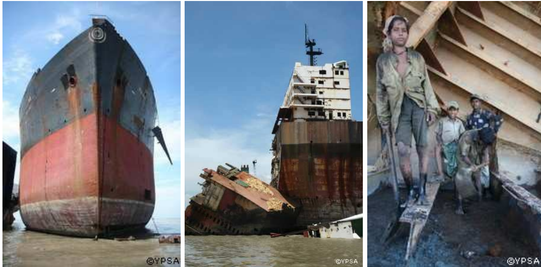
Chittagong shipbreaking yard, Bangladesh 2007