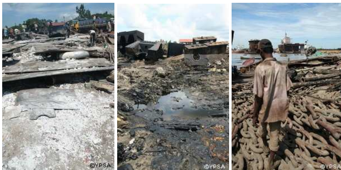
Asbestos and oil pollution, Chittagong shipbreaking yard, Bangladesh 2007