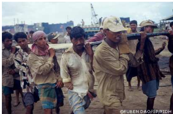
Workers, Chittagong shipbreaking yard, Bangladesh 2002

Unilateral action is likely to be the only pressure that will succeed in ensuring that the IMO regime is eventually strengthened from its current ineffectual state. Much as the original Basel Convention was weak and was only strengthened by regional accords that proceeded to accomplish what initial consensus could not, the EU must take leadership.